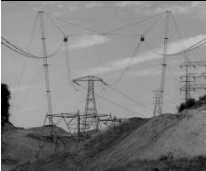
Figure 2 An ERS Chainette type structure is used to support the 500kV DC Intertie. Note the residential area to the left of the damaged tower and the steep down guy angle of the ERS.

LADWP crews immediately responded. They grounded and snubbed the conductor to prevent further damage, and a roadway under the line was barricaded for public safety. As a similar self-supporting tower was not available, LADWP crews installed a temporary IEEE Standard 1070 ERS structure. Due to the close proximity of residential houses, a steep down guy angle was required (Figure 2),. This was quickly analyzed using the emergency restoration structure structural analysis computer programs.