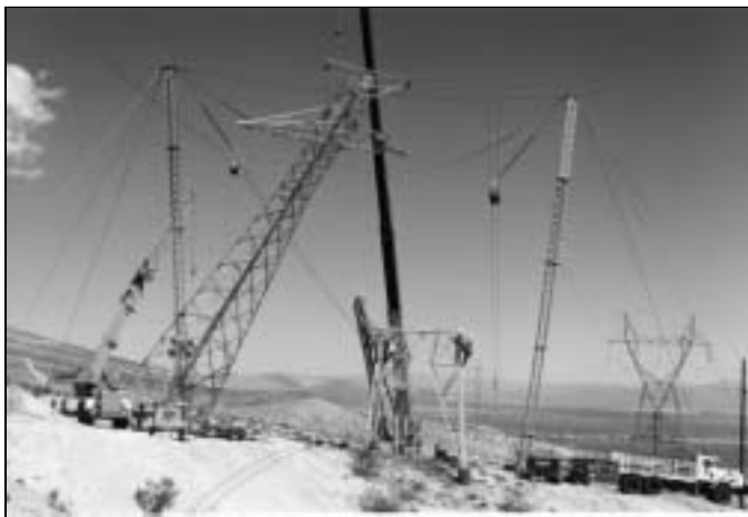
Figure 1 Permanent restoration of a self-supporting DC Intertie tower. The de-energized conductors are supported in the IEEE Standard 1070 ERS, the Owens line is shown at the right.

The permanent restoration of the DC Intertie was contingent on delivery of self-supporting tower steel, and the availability of DC Intertie. During the week of March 27, the northern crew transported the tower steel to the site and assembled the tower for erection, completing the restoration (see Figure 1).