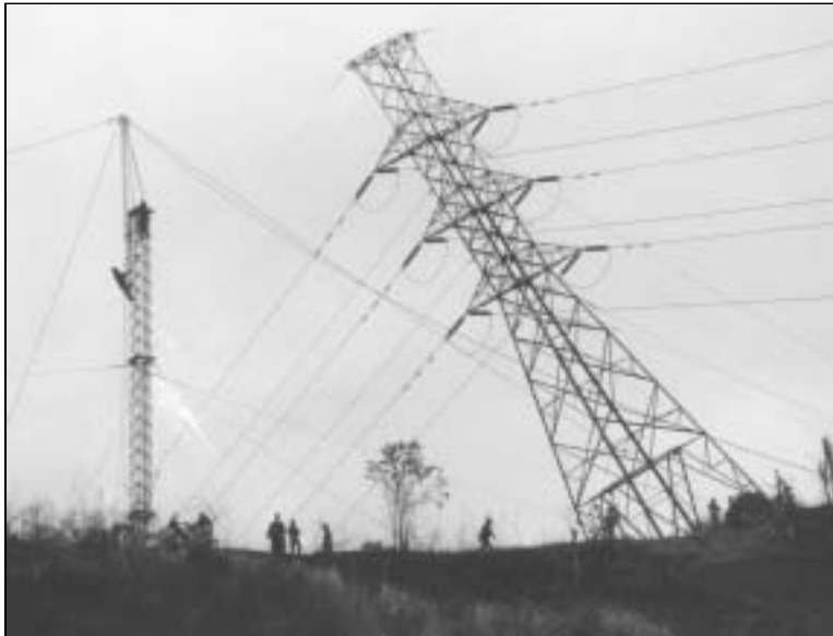
Figure 8 Vandals cut the legs of tension tower No. 44. This tower is located on the top of a narrow ridge. In order to keep the line energized, the conductor from one circuit was transferred to the ERS horizontal-vee structures while the other circuit was energized.

Two ERS horizontal vee temporary towers were used to bypass both circuits around the damaged tower. With these in place, the damaged tower could be replaced, as the foundation was not damaged. Access to this site was difficult. All line crews and equipment had to be flown in by helicopter. It took one day and 18 trips (of 20km each) to get all personnel and equipment to the site. Helicopters were required to fly in supplies everyday and the line crew camped at the site. Approximately 25 linemen were involved. A gin pole and small portable capstan hoist were used to construct each ERS horizontal vee tower. The horizontal vee towers were offset longitudinally from the damaged tower approximately 2 to 4m on either side. Since the site was on top of a ridge, the back and side guys on the ERS horizontal-vees were two to three times longer than normal, as can be seen in Figure 9.