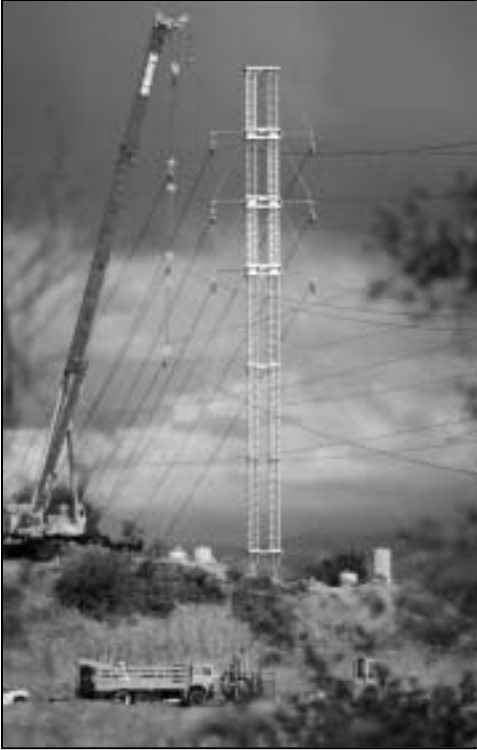
Figure 3 One 230kV circuit at the left is supported by the crane; two other circuits are supported by an IEEE Standard 1070 ERS. This double circuit 230kV ERS structure was designed for a narrow right-of-way.