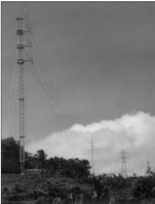
Figure 7 The photograph at the left shows the first circuit to be repaired. The conductor is transferred from Tower No.23 to one ERS while the ERS in the foreground bypasses Tower No. 24, destroyed by a mud slide.

It was decided to restore both circuits with four horizontal-vee ERS structures. Due to the remote location, all ERS material had to be hand carried the last 2km to the site of the land slide. The four horizontal-vee ERS structures were built in five days using an aluminum gin pole and a small portable capstan hoist. The foundation of the ERS was placed on the sloping and unstable soil of the mud slide. It took an additional two days to transfer the conductor. Figure 7 shows one of the circuits transferred and the ERS for the second circuit under construction. Both circuits were re-energized in seven days.