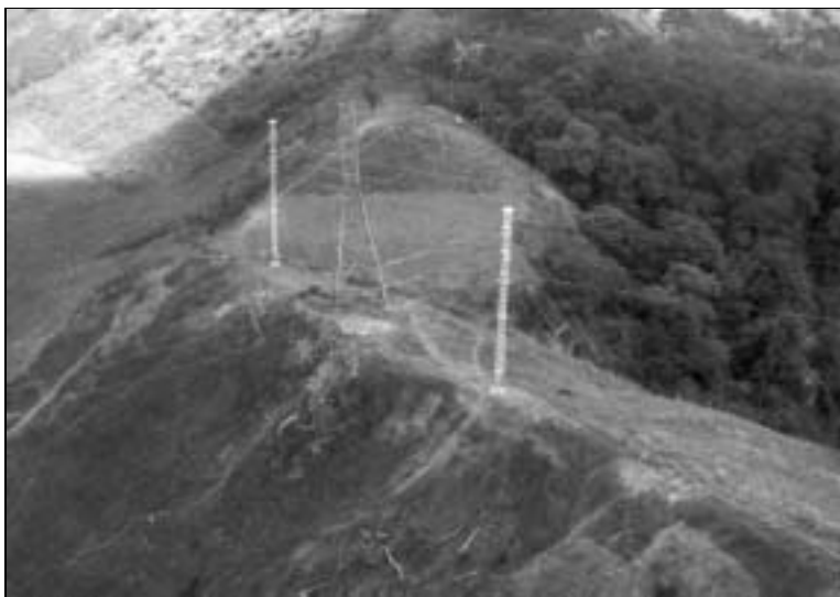
Figure 9 The photograph to the left shows the placement of the two ERS horizontal-vee structures directly on top of the ridge. Note that the dead-end insulators and hardware are in the span and to the left of the ERS in the foreground.